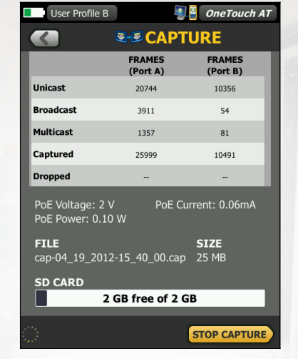
Figure 5. Proof of successful Wi-Fi operation