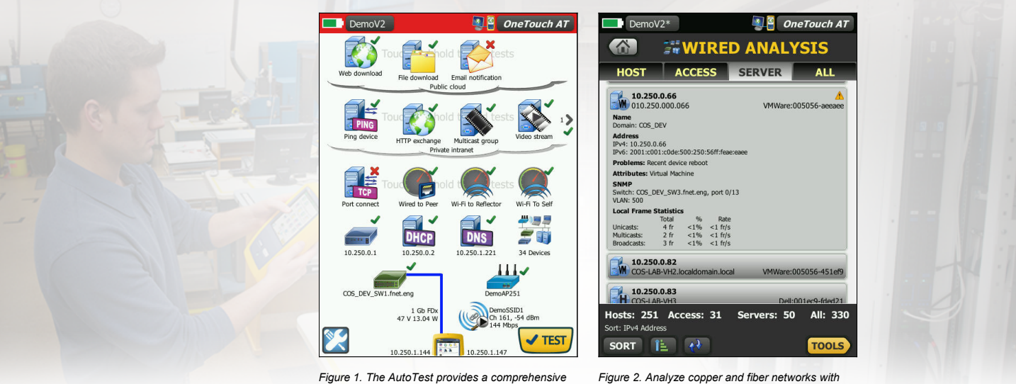
Figure 1. The Auto rest provides a comprehensive measurement of network performance from the end user point-of-view, from cable to services and applications

Use the intuitive touch interface to create test profiles, or test scripts, tailored to specific networks, services, and applications. Build profiles to accommodate different types of users, devices, locations or technologies. Profiles can be very simple with just a few tests or advanced with dozens of tests. Once created, profiles can be saved for quick and easy reuse later. Create a library of standardized profiles to elevate the troubleshooting know-how of the entire network support staff. Use the profiles to establish best practices for faster, more productive troubleshooting.